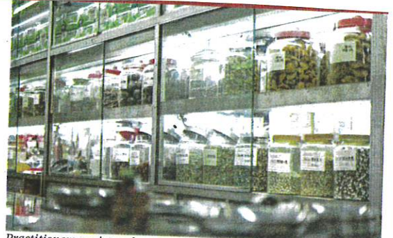
Practitioners registered under the Traditional and Complementary Medicine Act 2016 (Act 775) will not be required to register with the Customs Department.

Finance Minister II Datuk Seri Amir Hamzah Azizan said the ex-