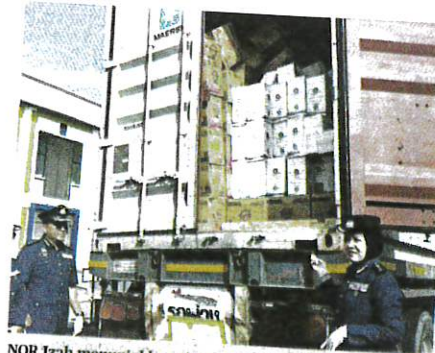
NOR Izah menunjukkan air zamzam bernilai RM1.3 juta dalam sebuah kontena yang tidak dilikrarkan.

AKHBAR : HARIAN METRO MUKA SURAT : 13 RUANGAN : LOKAL