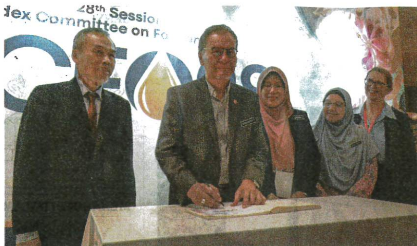
DR. Dzulkefly Ahmad pada majlis perasmian Mesyuarat Jawatankuasa Codex bagi Lemak dan Minyak (CCFO) ke-28 di Kuala Lumpur, semalam.

AKHBAR : UTUSAN MALAYSIA MUKA SURAT : 4 RUANGAN : DALAM NEGERI