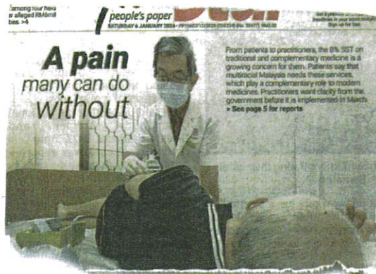
Flashback: Our report on Jan 6, 2024.

"The government has acknowledged that SMEs still have a journey ahead before they can enter